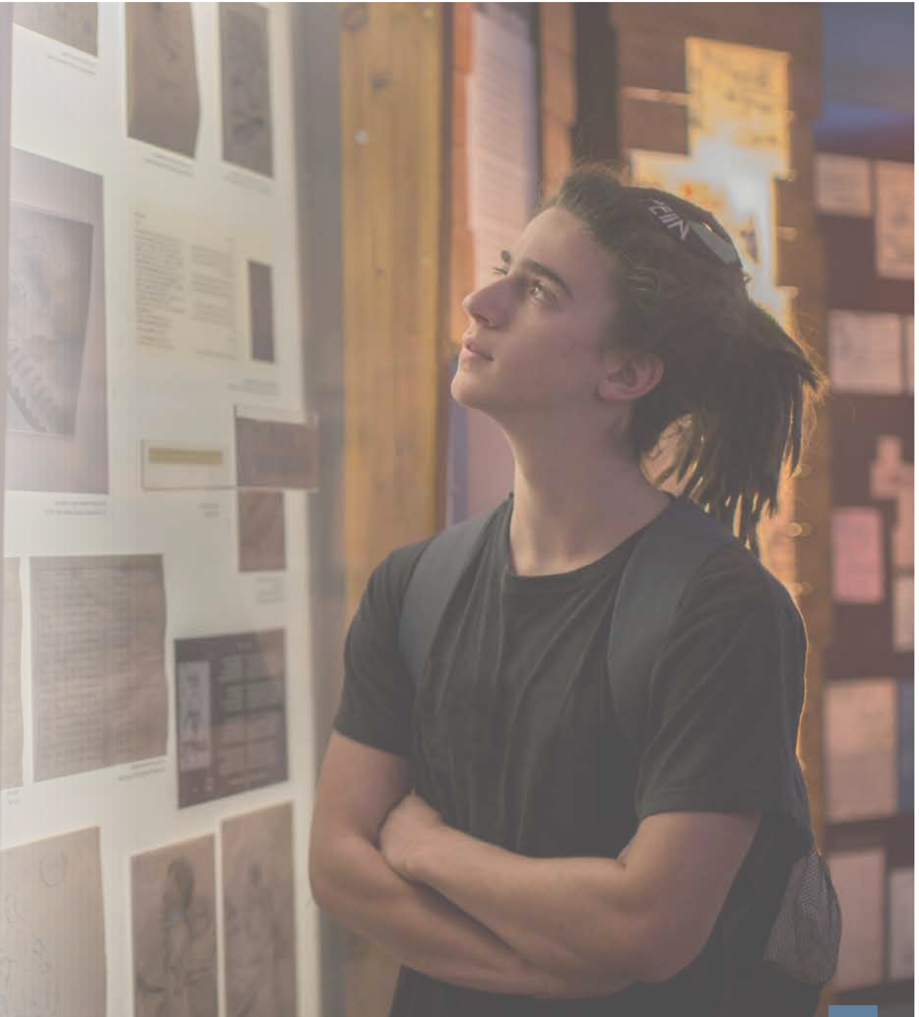
Photo: LAMOTH Fellow from Hartman High School, Jerusalem visits Beit Terezin Museum in Israel