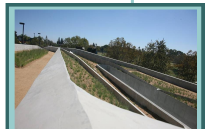
The Museum's green roof, designed with a completely organic roof top garden, provides an opportunity for contemplation amid panoramic city views

One adult must accompany every 15 children under the age of 18 at all times in the Museum. An adult with a baby is not considered a suitable chaperone.