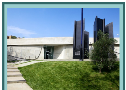
Entrance to the Museum, next to the Martyr's Memorial.

The Museum's location in Pan Pacific Park provides teachers and students with a wonderful opportunity to discuss, debrief and reflect on their visit in a tranquil place.