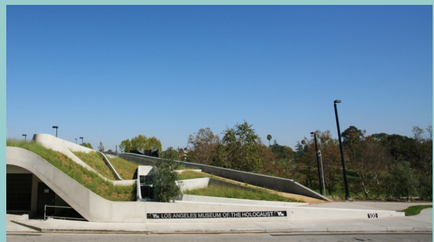
The eco-friendly green roof of the Museum, located in Pan Pacific Park, near The Farmer's Market and The Grove.

unique programming in the field of Holocaust education. LAMOTH was the first museum in the country to create a teacher training program to train educators on how to teach the Holocaust in the classroom.